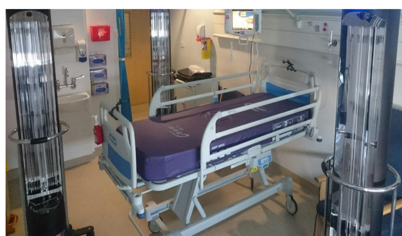
Figure 1 The Surfacide® Helios™ whole-room disinfection UV-emitting lamp set-up in rooms in a "triangular" arrangement. The lamps use a laser-mapping system to measure the room size and determine the cycle duration. A control unit (tablet device) controls the system remotely from outside the room.

UV irradiation technologies may offer advantages over manual decontamination by increasing coverage and access to difficult-to-clean areas. As part of an infection-control programme, two UV-irradiation devices were introduced into a London teaching hospital and evaluated for disinfection efficacy.