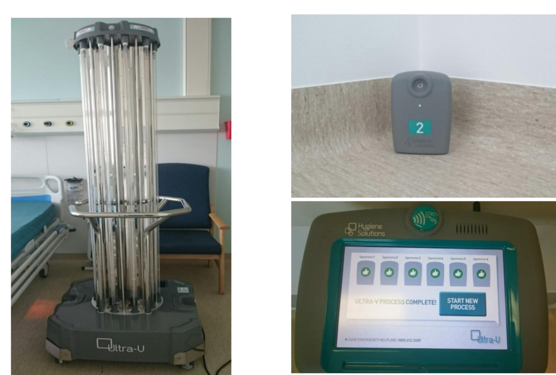
Figure 2a (left) The Hygiene Solutions Ultra-V™ whole-room disinfection UV-emitting lamp. Figure 2b (top right) The Hygiene Solutions UV-sensing device (Spectromer). Figure 2c (bottom right) Operating the Hygiene Solutions Ultra-V™ system from outside the room: the control-unit guides the operator and alerts when the disinfection cycle is complete.